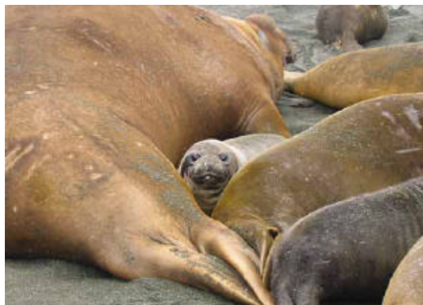
bottom: Baby seal